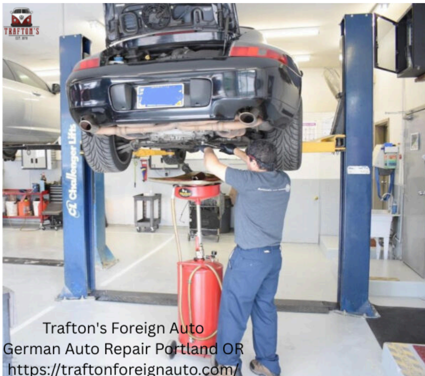
Trafton's Foreign Auto German Auto Repair Portland OR https://traftonforeignauto.com/