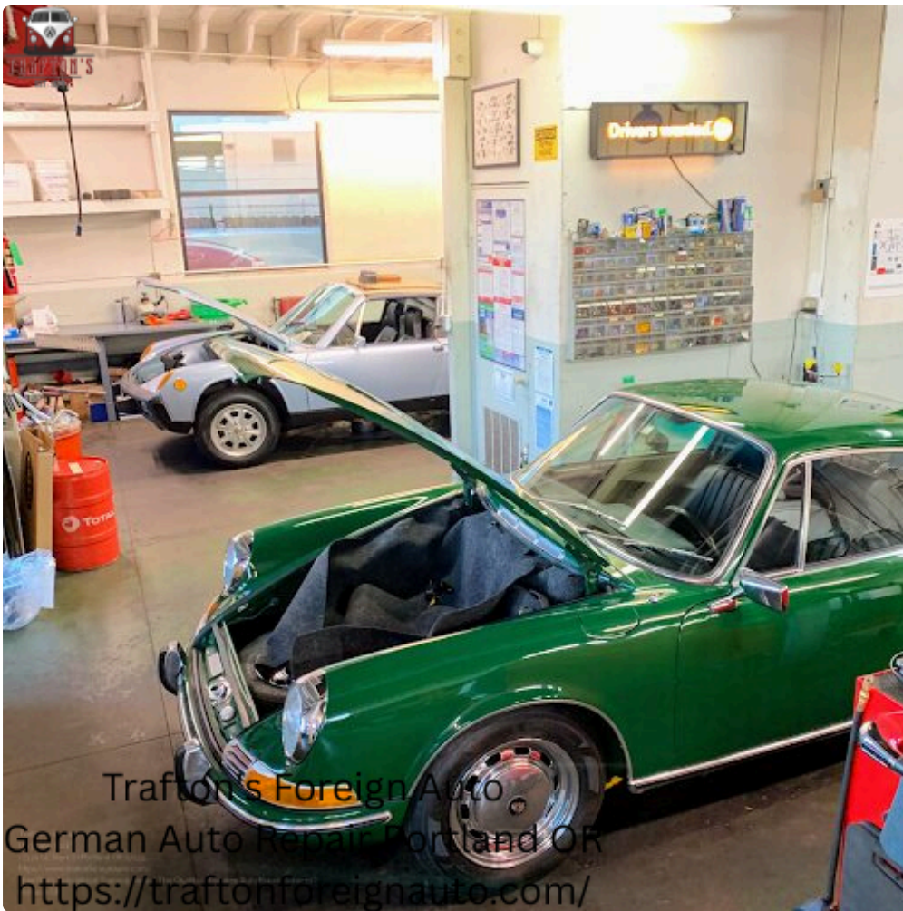
Trafton's Foreign Auto German Auto Repair Portland OR https://traftonforeignauto.com/