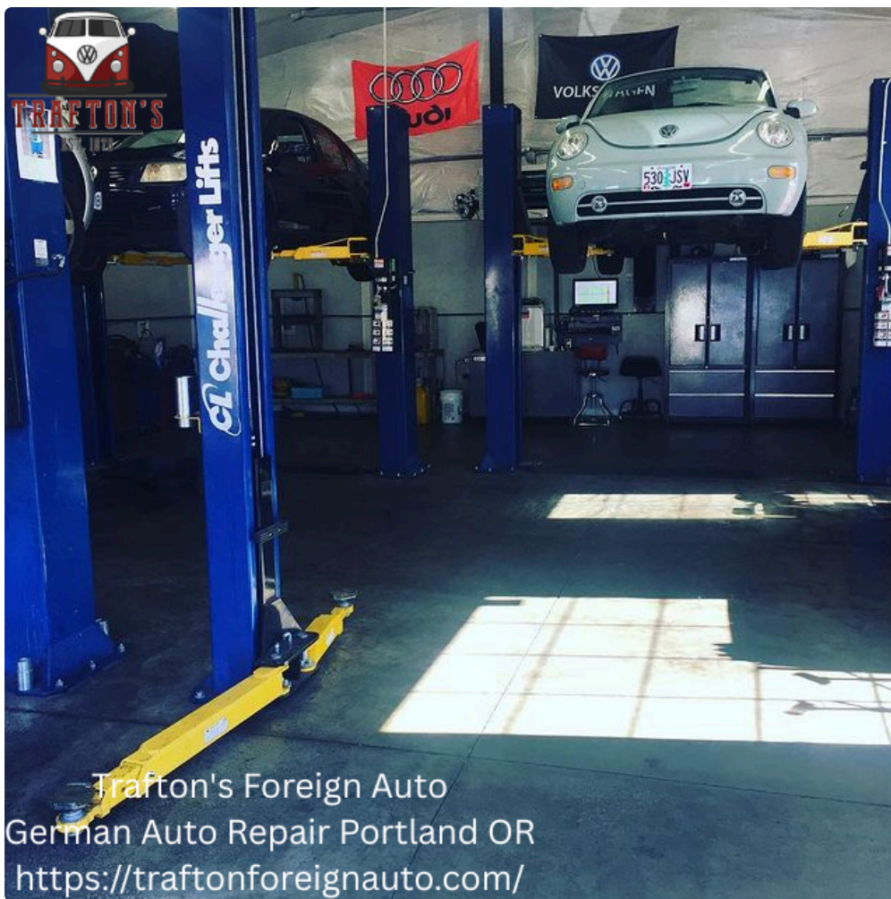
Trafton's Foreign Auto German Auto Repair Portland OR https://traftonforeignauto.com/

Rhom Auto identifies itself as a Portland retailer that specializes in BMW and Porsche restoration. Again, that concentrated scope matters. A shop that most likely works on a few manufacturers primarily develops a sharper sense of customary subject matters, service styles, and what indications deserve instantaneous interest.